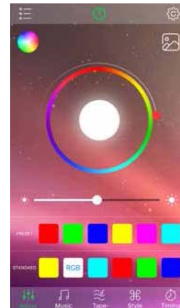
HAPPY LIGHTING APP

Step 7: Ensure your phone has Bluetooth turned on so that it can connect to the transformer/controller.